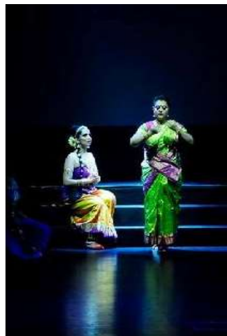
PERFORMANCE AT THE MADINATH