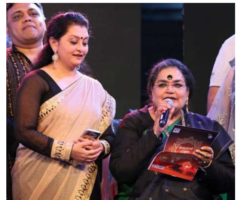
WITH USHA UTHAP JI