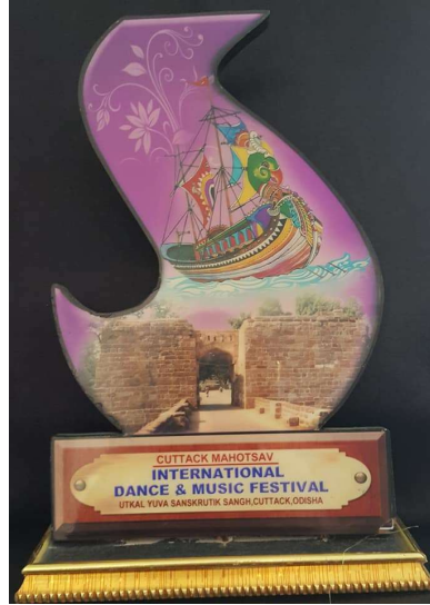
NRITAY RATA TITLE