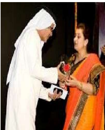
KR ANNUAL DAY