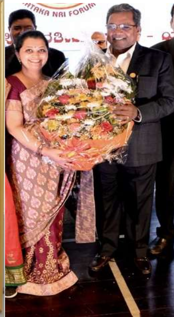
KARNATAKA STATE GOVERNMENT