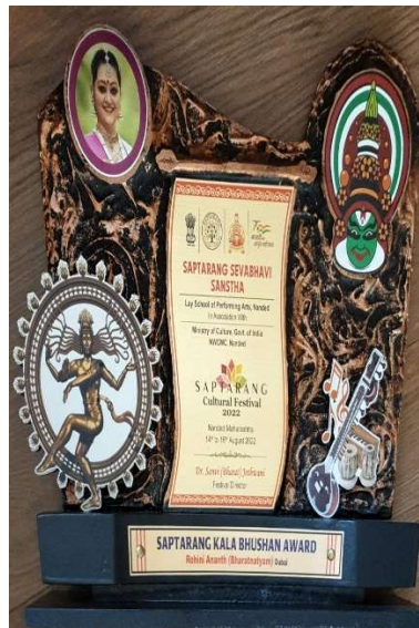
SAPTARANG KALA BHUSHAN AWARD