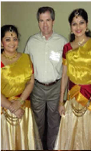
WITH MORRISVILLE MAYOR IN USA