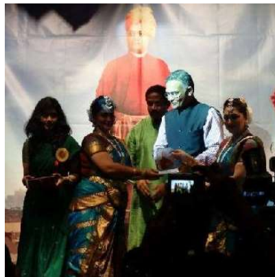
WITH CONSUL GENERAL OF INDIA