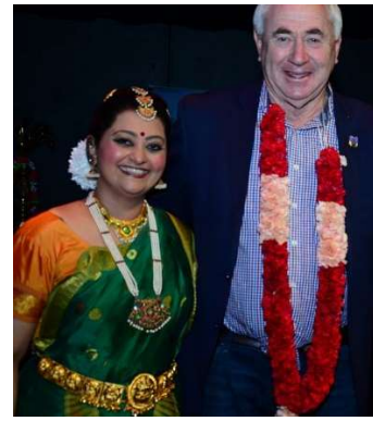
WITH MAYOR OF TOWOOMBA