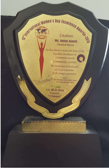
INTERNATIONAL AWARD FOR PROMOTING INDIAN DANCE ABROAD