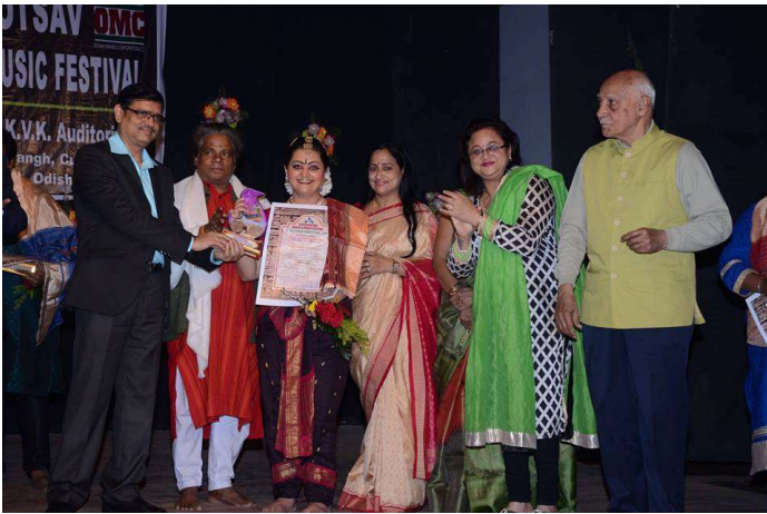
NRITYA RATNA AWARD