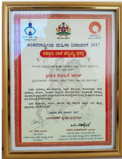
RANI CHENNAMMA AWARD BY