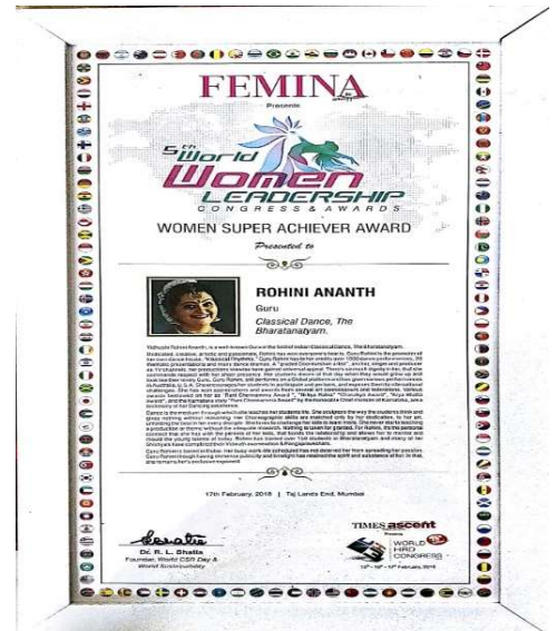
WOMEN SUPER ACHIEVER AWARD