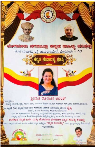
KANNAADIGA SEVA RATNA