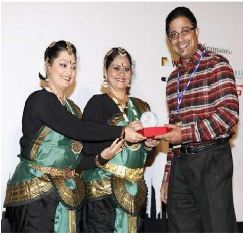
PERFORMANCE AT ATLANTIS