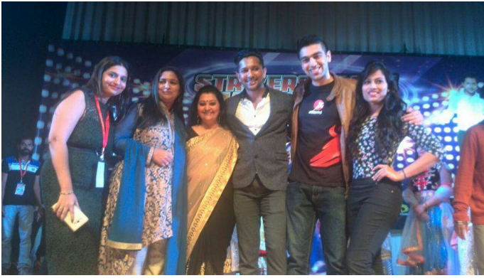
WITH TERENCE LEWIS – JURY FOR DANCE CHALLENGE